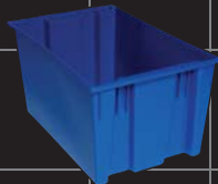
Stackable & Nestable