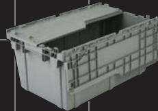
Attached Lid Containers