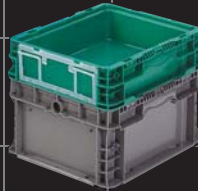
Stackable Containers and Bins