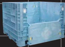
Bulk Boxes Pallet-Sleeve

Please call Flexcon for help in selecting the perfect containers and/or pallets to help make your material handling system 100% efficient! Ask for our New Free Guide To Material Handling Containers & Pallets.