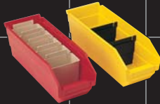
Hopper Front Containers